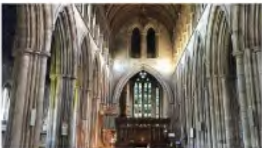
Sunday Morning Services Live Streaming