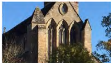
Sunday Morning Service - 23 July 2023