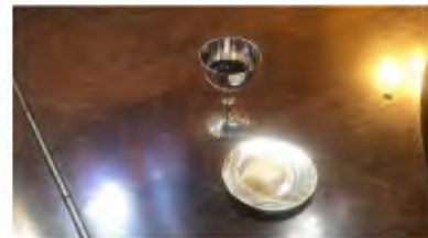
Sunday Morning Service & Communion - Pentecost Sunday, 28 May 2023

Digital services of worship remain second nature for many, both in terms of delivery and in terms of participation. As well as routinely broadcasting worship online on a Sunday morning throughout the period, there have also been special online services at Christmas and Easter, a Cathedral Kids Nativity Service, and Advent Reflections. Weekly “Prayers for Ukraine” have also been held since the outbreak of the crisis in Ukraine. A major new development this year has been the successful implementation of live streaming of services, and this has been very much welcomed by a substantial online community. This activity has supplemented many ongoing pastoral care initiatives by either elders or the pastoral care volunteers who have continued to reach out to support district members and other community needs of the elderly, vulnerable or isolated, either directly, by telephone or e mail, or in conjunction with the Dunblane Community Support Group.